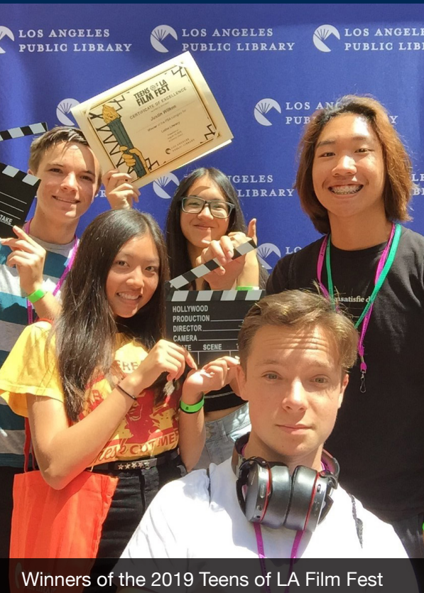
Winners of the 2019 Teens of LA Film Fest